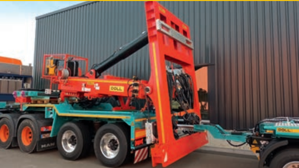
Lifting adapter with hydraulic lifting equipment for 3-, 4- or 5-axle truck (depending on permitted axle load)

We offer a full range that covers rigid, mechanical and hydraulic adapter solutions. Looking for something lightweight and inexpensive? A lifting adapter with mechanical lifting equipment is what you need. For maximum operating comfort, the hydraulic adapter provides a lift of up to 1,800 mm and can be mounted on a fifth wheel coupling or a dolly, depending on the requirements. What all three systems have in common is their exceptionally low coupling height and a possible saddle load of up to 32 tons.